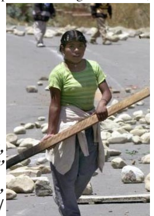
Photo: Bolivian Insurgent, Ready for the "Clenched Fist" of President Banzer. Sept 2000