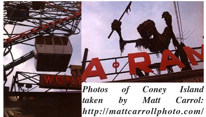
Photos of Coney Island taken by Matt Carrol: http://mattcarrollphoto.com/

(I am now capable, while fully conscious, of performing a procedure on myself which one doctor’s website re-